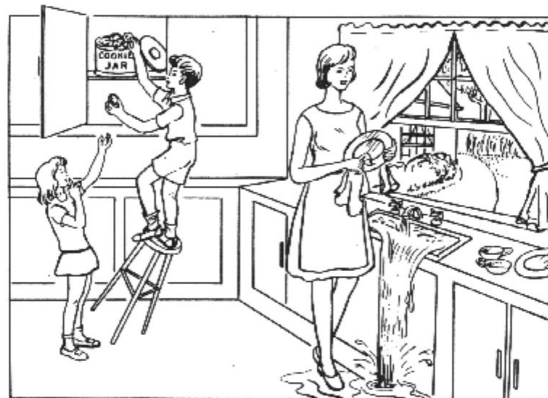
Figure 1: The Cookie Theft picture, from the Boston Diagnostic Aphasia Examination [21].

The topics used during discourse production may be subject to an internal, structural organization in order to achieve an information hierarchy. This organizational structure allows a gradual organization of information that is essential for an effective